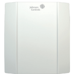
Carbon Dioxide Room