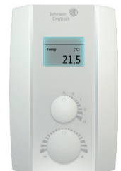
Analog Room Sensor

Book a demo with your Johnson Controls representative now!