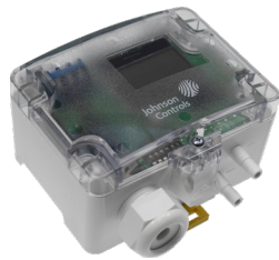
Differential Pressure with Display