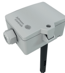
Carbon Dioxide Duct